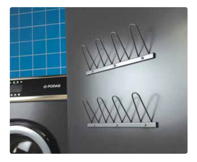
Hook Rack Door mounted hook rack for ancillary garments (set of 3).

For 4 pair of gloves, part no 131008 For 2 pair of boots, part no 131009